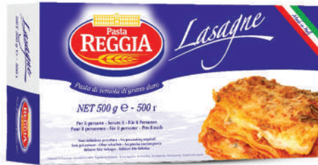
Lasagne Pasta 500g