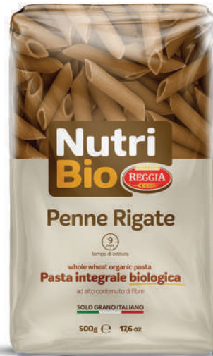
Penne Rigate 500g