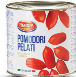
Italian Peeled Tomatoes 2500g

Layer up the flavor with our classic Lasagne Pasta—perfect for rich, oven-baked dishes. Firm, flat sheets hold sauces beautifully for hearty, satisfying meals every time. Long, ribbon-like strands of Fettucce Pasta are ideal for creamy and meaty sauces.