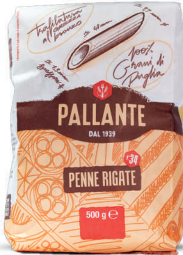
Penne Rigate 500g