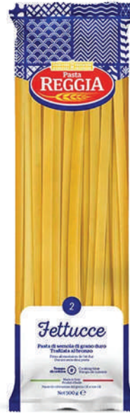
Fettucce Pasta 500g